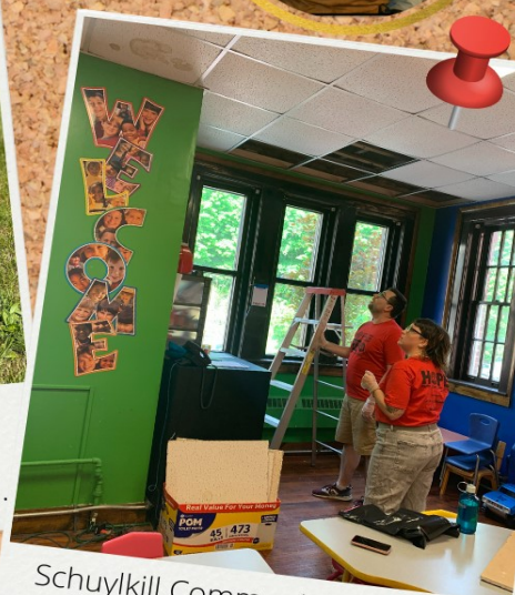
Schuylkill Community Action replacing tiles in the kids' rooms at Schuylkill YMCA.