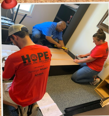
Lowes Distribution #961 built new shelving units at Nurse-Family Partnership in Pottsville.