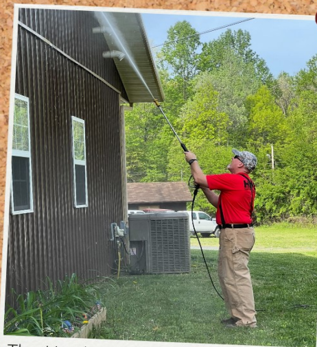
The Hawk Mountain Scout Reservation Camp was prepped for summer campers by over 150 volunteers.