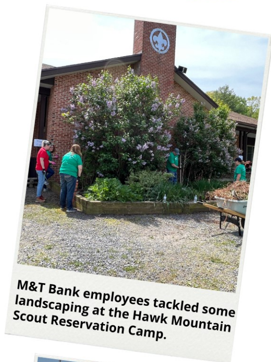
M&T Bank employees tackled some landscaping at the Hawk Mountain Scout Reservation Camp.

St. Luke's Hospital - Miners Campus, EMD Electronics *The work in Tamaqua could not have been accomplished without the efforts made by: Tamaqua SOS Save Our Station, Tamaqua Borough, Hope & Coffee, Tamaqua Historical Society.