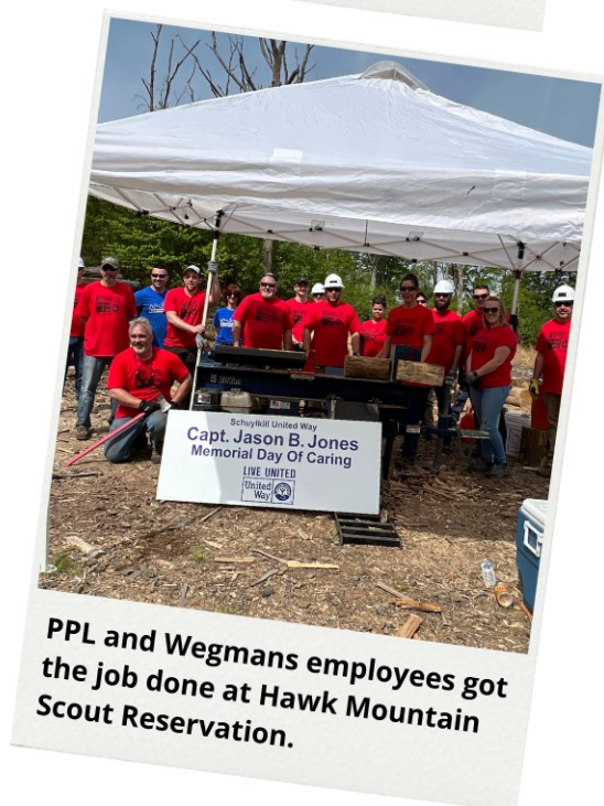
PPL and Wegmans employees got the job done at Hawk Mountain Scout Reservation.