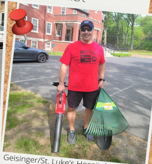
Geisinger/St. Luke's Hospital was one of many groups that lent a hand at Avenues.

600 volunteers painted, organized, cleaned, constructed, cooked, and in various other ways strengthened our Schuylkill County community during the annual SUW Captain Jason B. Jones Memorial Day of Caring.