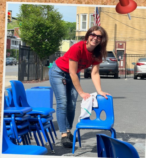
EMD Electronics did various jobs in Tamaqua - including cleaning up at Child Development, inc.