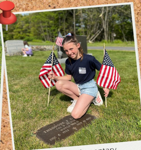
Blue Mountain Elementary WEST students placed flags on veterans' graves in Cressona.