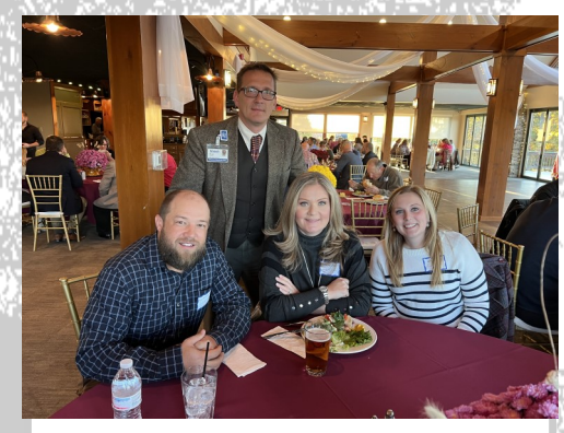
St. Luke's Miners Campus employees at our Pacesetters Reception .

of the Schuylkill United Way is the roots from which the annual campaign grows and flourishes each year. Its members represent strength, determination, and reliability, and because of them, over half of the residents of Schuylkill County were helped by at least one of our partner agencies last year. That's why in Schuylkill County, we are proud to be united to make a difference!