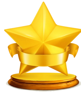
2020 Recipient—Ed Redding